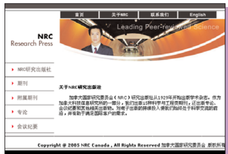
▲ The NRC Research Press Chinese language website, developed by experienced staff in Charlesworth's Beijing office.

The Journals are supplied to approximately 900 Chinese academic and university libraries, who are part of the consortium, through a searchable server hosted in China. This means that content of the NRC Research Press Journals are accessed locally increasing download speeds and avoiding the levies made to some Chinese users when material is downloaded from international sources outside China.